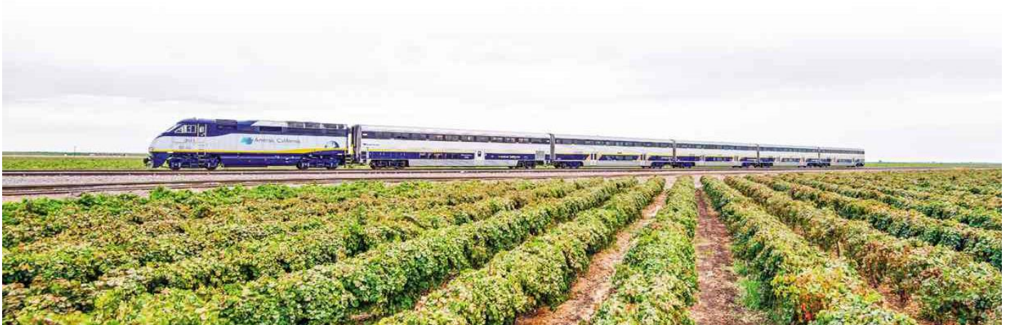
Amtrak Photo by Jeremiah Nueve